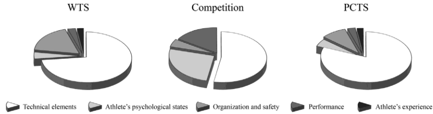
Fig. 2. Distribution of compatible information elements between the athletes' and coaches' SA according to session.

what the athlete focused on, thought, and felt, than they explained possible causes of athlete's behavior and situation, and whether the athlete's behavior and situation fitted ideal/expected behavior and situation. However, in comparison to athletes, coaches more frequently compared the phenotype with genotype schemata (see also Table 4).